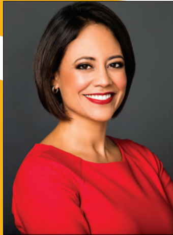
Cynthia Izaguirre Ch. 8 WFAA News Anchor