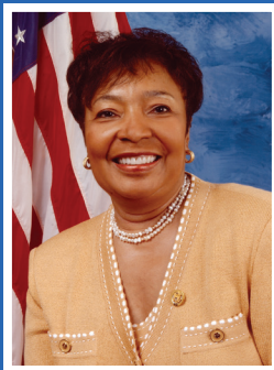
U.S. Rep. Eddie Bernice Johnson Distinguished Health Service Award