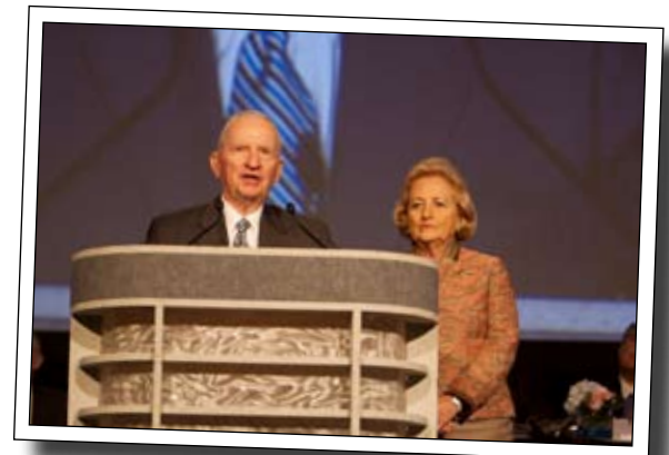
Ross and Margot Perot - 2008