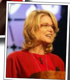
Paula Zahn, 2010