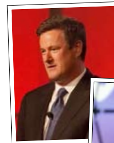
Joe Scarborough, 2009