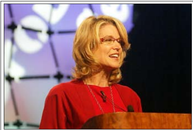
Paula Zahn, former CNN television reporter, was the 2010 AAL Keynote Speaker.