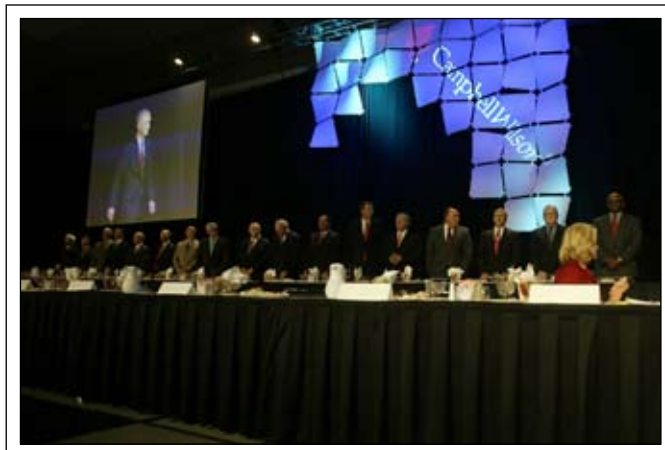
The Chairs of the board of trustees of each DFWHC-member hospital were introduced.